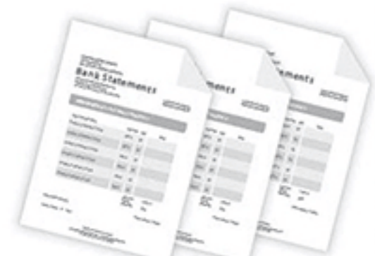
Bank Statements - latest 3 months