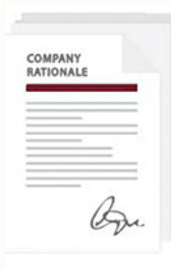
Letter introducing the Company - Business Plan