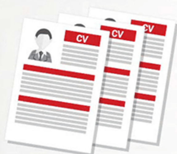
Up to date Resume