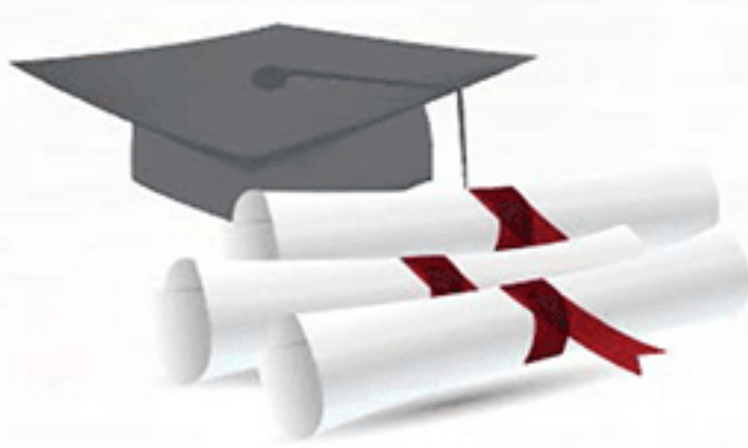
Proof of Academic Qualifications