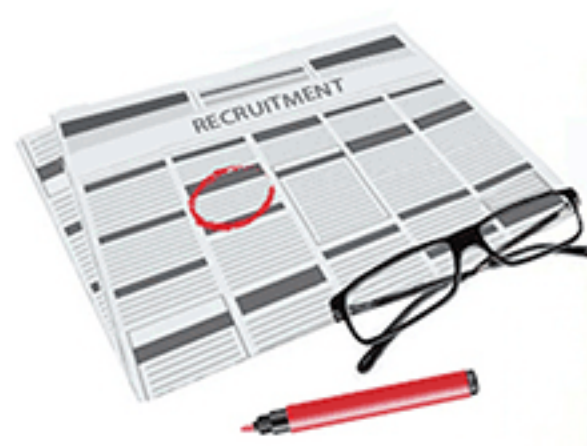
Local Recruitment Exercise - Job Posting & Candidates' CVs

Employer will need to provide additional documents if the Company didn't receive any Employment Visa Approval in the Past 18 months