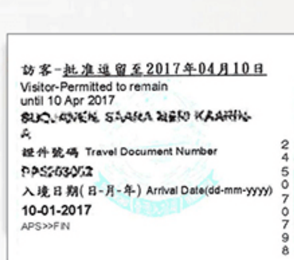
White Visitor Visa Slip - if already in Hong Kong