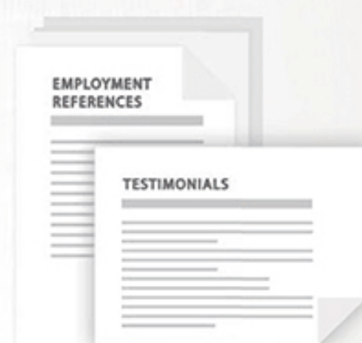
Employment References and Testimonials