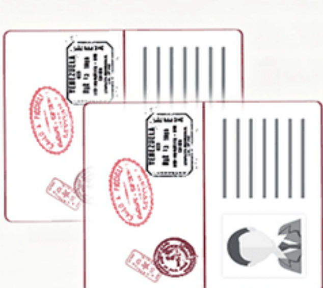
Passport - Applicant & each family member