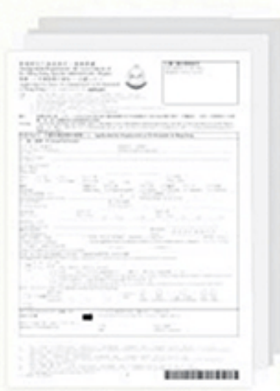
Sponsorship Form ID990B

if the Company obtained an Employment Visa Approval in the past 18 months