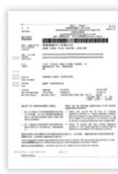
Updated Business Registration Certificate