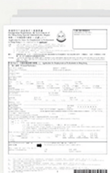
Application Form ID990A