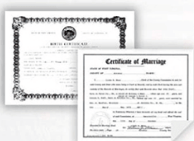
Marriage & Birth Certificates relating to the dependants