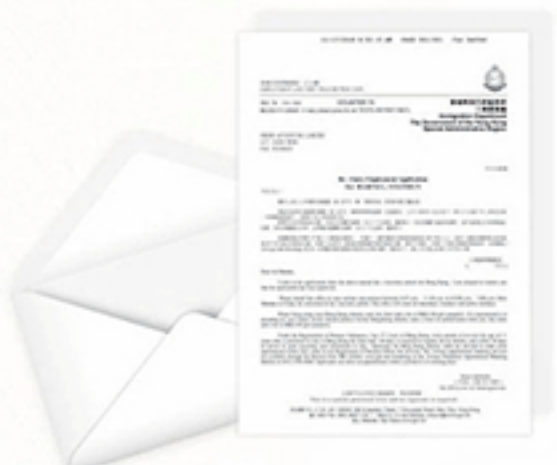
Approval Letter from Immigration Department