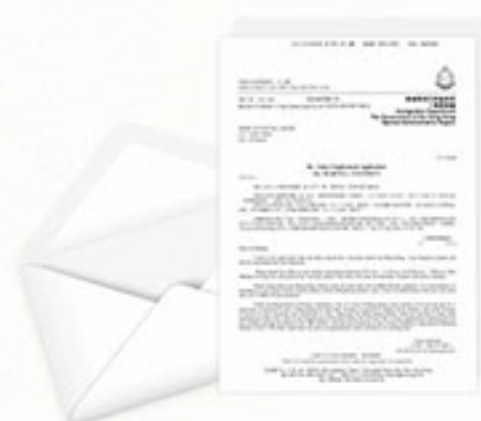
Approval Letter from Immigration Department