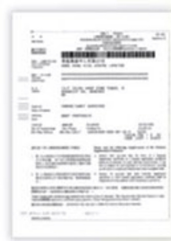
Updated Business Registration Certificate