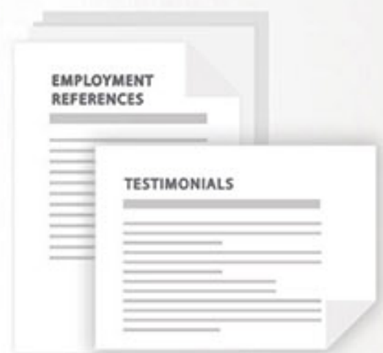
Employment References and Testimonials