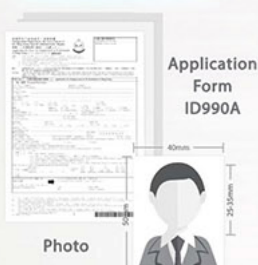
Application Form ID990A