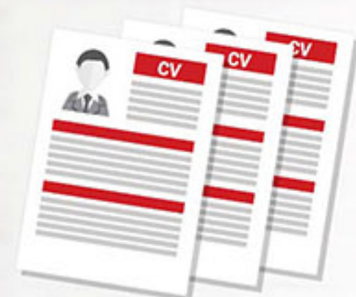
Up to date Resume