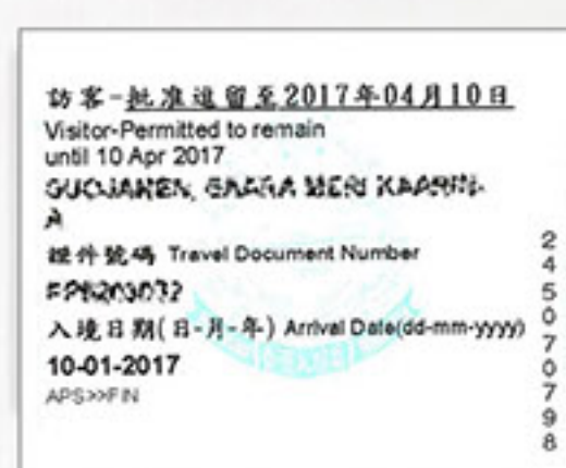
White Visitor Visa Slip - if already in Hong Kong -