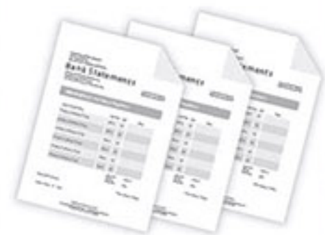
Bank Statements - latest 3 months -