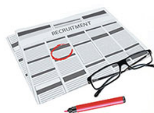
Local Recruitment Exercise - Job Posting & Candidates' CVs-

Employer will need to provide additional documents if the Company didn't receive any Employment Visa Approval in the Past 18 months