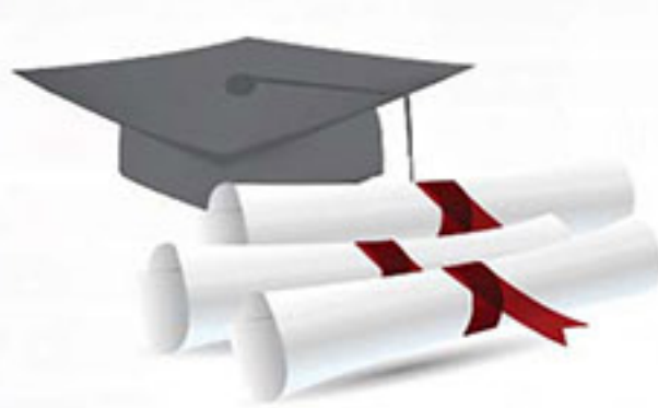
Proof of Academic Qualifications