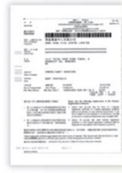
Updated Business Registration Certificate