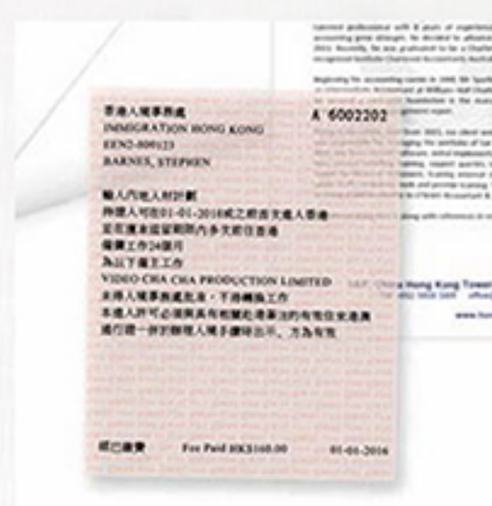
Current Valid Dependant Visa