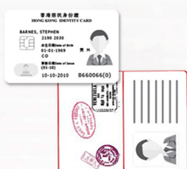
Passport & Hong Kong ID