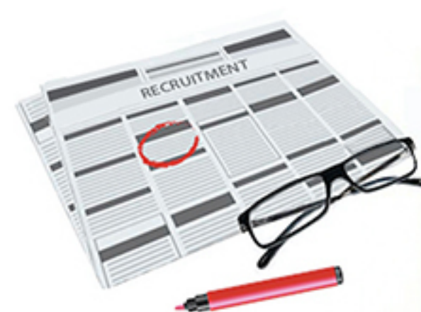
Local Recruitment Exercise - Job Posting & Candidates' CVs-

Employer will need to provide additional documents if the Company didn't receive any Employment Visa Approval in the last 18 months