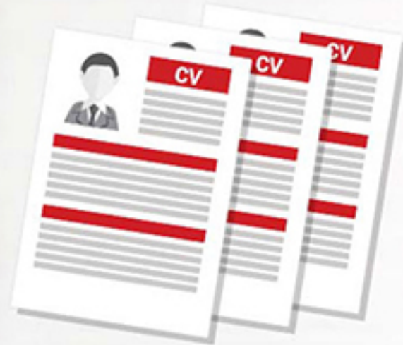
Up to date Resume