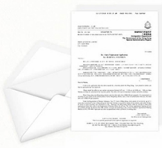
Approval Letter from Immigration Department