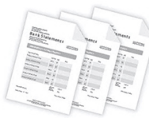
Bank Statements - latest 3 months -