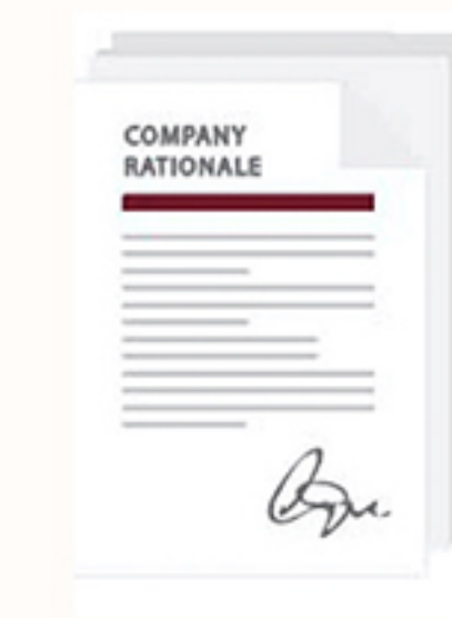
Letter introducing the Company - Business Plan -