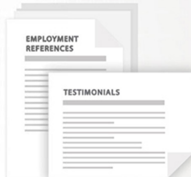
Employment References and Testimonials