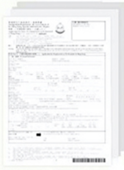
Sponsorship Form ID990B

if the Company obtained an Employment Visa Approval in the past 18 months