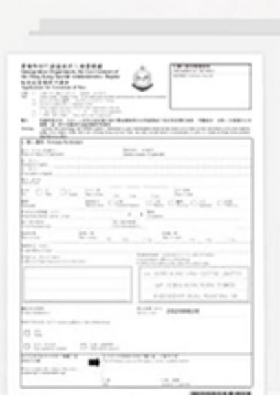
Application Form ID990A