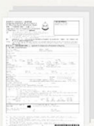
Application Form ID990A