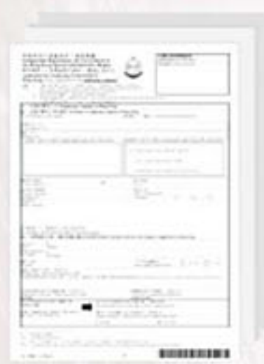
Sponsorship Form ID990B

if the Company obtained an Employment Visa Approval in the past 18 months