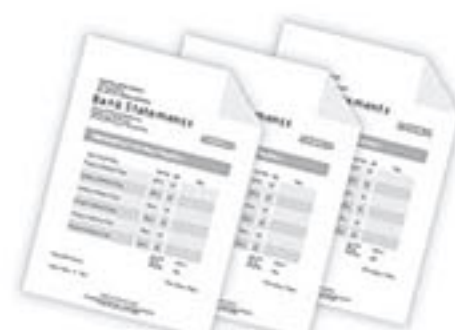
Bank Statements - latest 3 months -