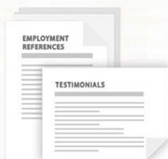
Employment References and Testimonials