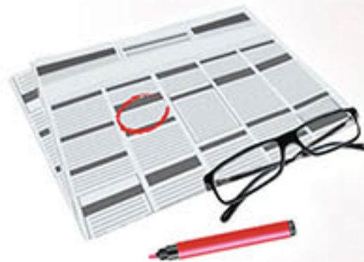
Local Recruitment Exercise - Job Posting & Candidates' CVs-

Employer will need to provide additional documents if the Company didn't receive any Employment Visa Approval in the last 18 months