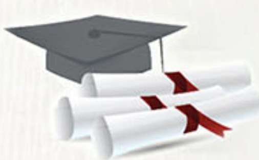
Proof of Academic Qualifications