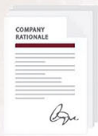
Letter introducing the Company - Business Plan -