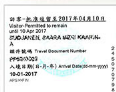
White Visitor Visa Slip - If already in Hong Kong -