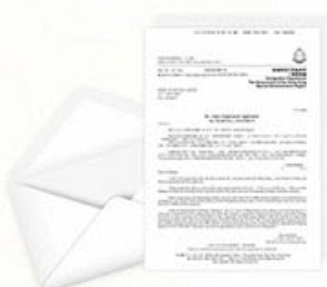
Approval Letter from Immigration Department