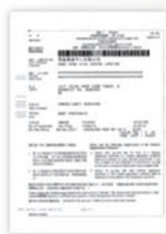
Updated Business Registration Certificate