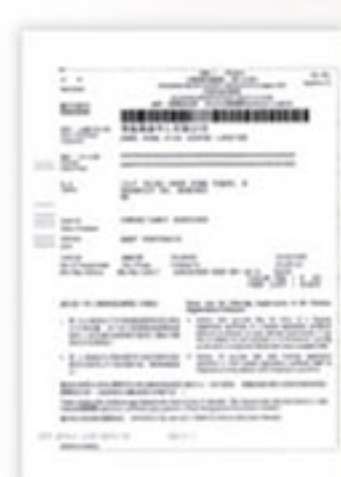
Updated Business Registration Certificate