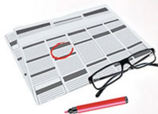
Local Recruitment Exercise - Job Posting & Candidates' CVs-

Employer will need to provide additional documents if the Company didn't receive any Employment Visa Approval in the last 18 months