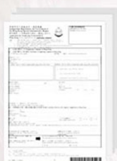
Sponsorship Form ID990B

if the Company obtained an Employment Visa Approval in the past 18 months