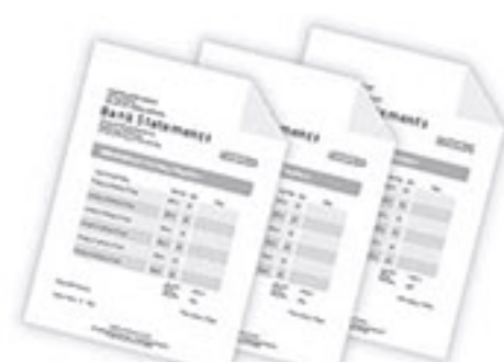
Bank Statements - latest 3 months -