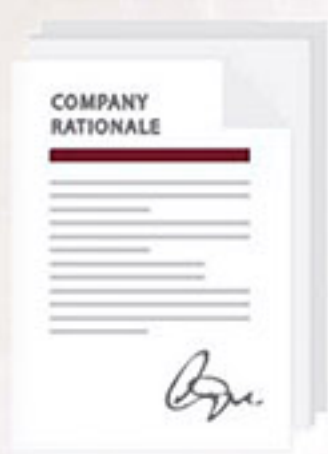
Letter introducing the Company - Business Plan -