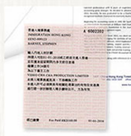
Hong Kong ID and Current Employment Visa