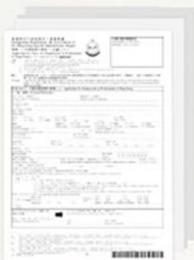
Application Form ID91