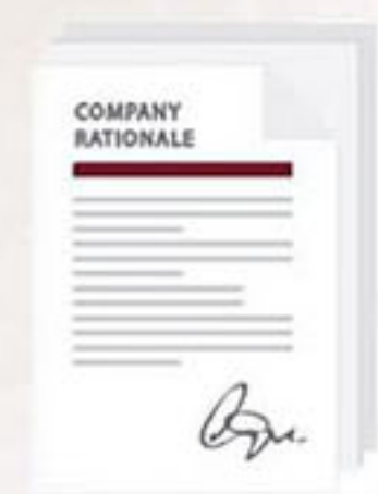
Letter introducing the Company - Business Plan -