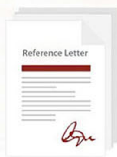
Employment References and Letter of Consent ID990A page 5 from employer in China or relevant Mainland Authorities