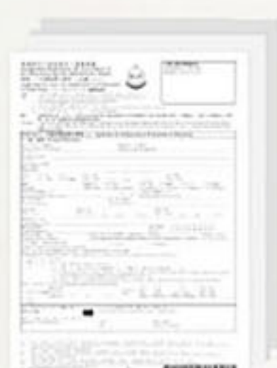
Application Form ID990A