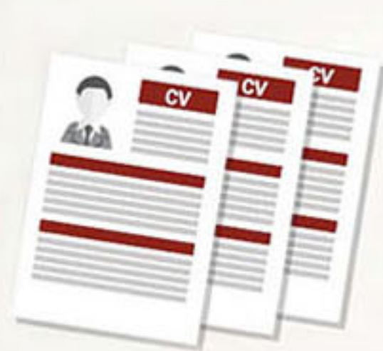
Up to date Resume