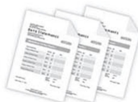
Bank Statements - latest 3 months -