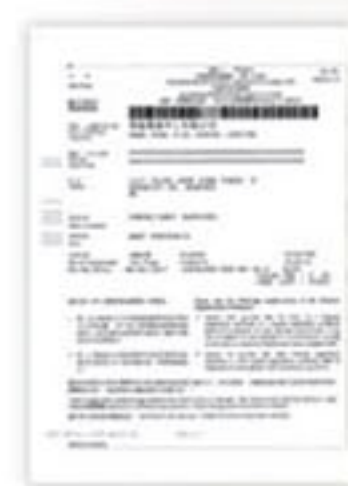
Updated Business Registration Certificate