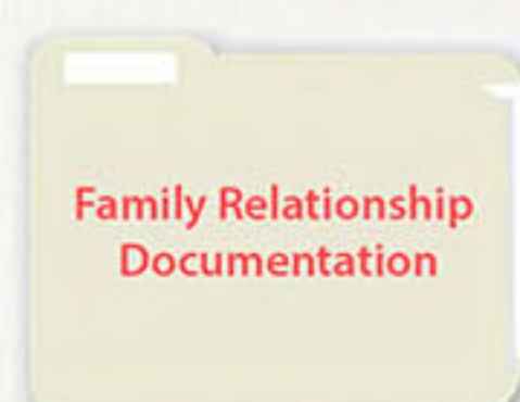
Proof of Family Relationship - Marriage Certificate, Birth Certificate -