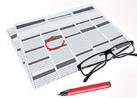
Local Recruitment Exercise - Job Posting & Candidates' CVs-

Employer will need to provide additional documents if the Company didn't receive any Employment Visa Approval in the last 18 months