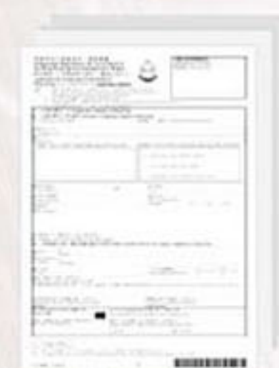
Sponsorship Form ID990B

if the Company obtained an Employment Visa Approval in the past 18 months