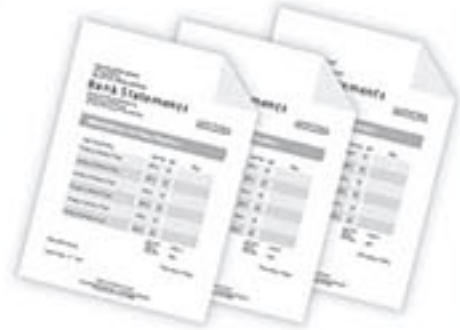
Bank Statements - latest 3 months -