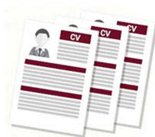
Up to date Resume