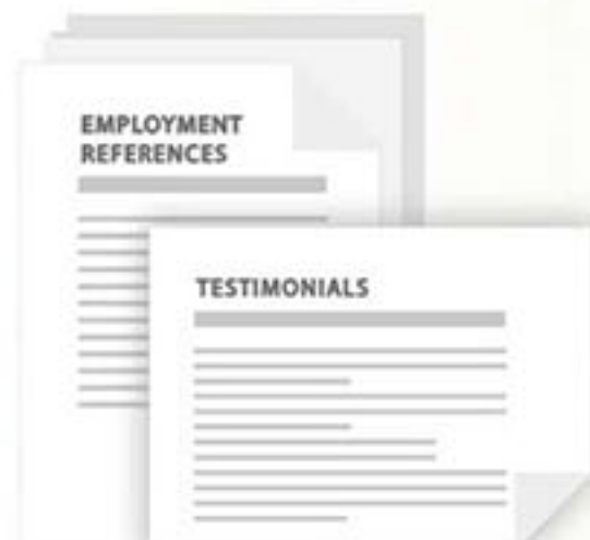
Employment References and Testimonials