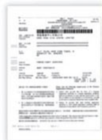
Updated Business Registration Certificate