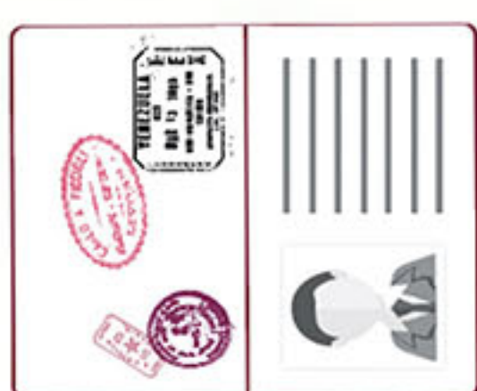
Passport -from Applicant & each family member-