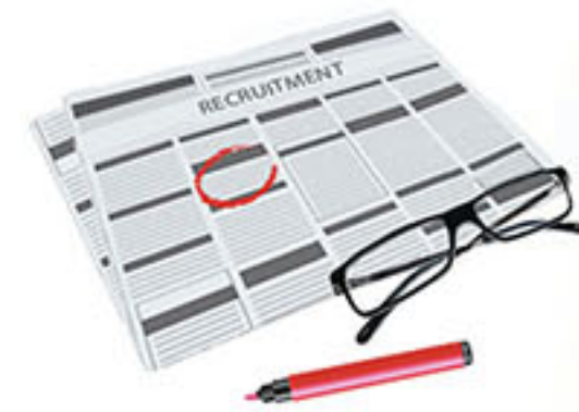
Local Recruitment Exercise - Job Posting & Candidates' CVs-

Employer will need to provide additional documents if the Company didn't receive any Employment Visa Approval in the last 18 months