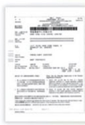
Updated Business Registration Certificate