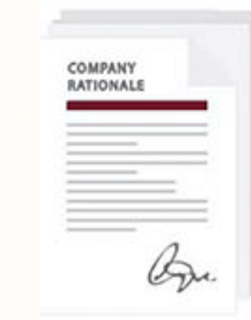
Letter introducing the Company - Business Plan -