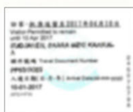
White Visitor Slip - if already in Hong Kong -