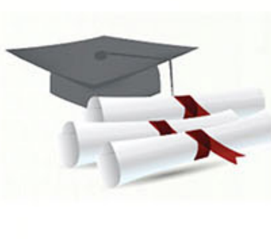
Proof of Academic Qualifications