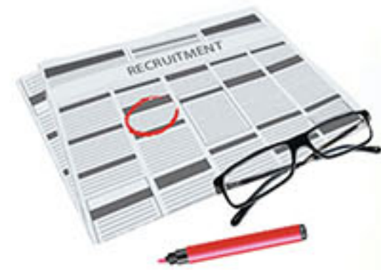
Local Recruitment Exercise - Job Posting & Candidates' CVs-

Employer will need to provide additional documents if the Company didn't receive any Employment Visa Approval in the last 18 months