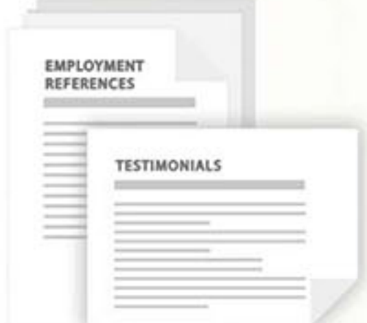
Employment References and Testimonials