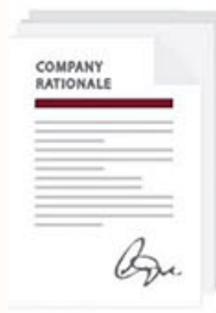
Letter introducing the Company - Business Plan -