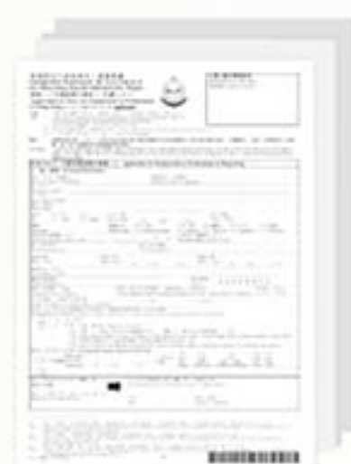
Application Form ID990A