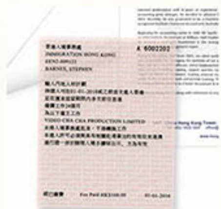
Hong Kong ID and Current Valid Dependant Visa