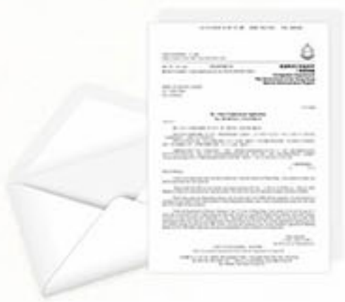
Approval Letter from Immigration Department