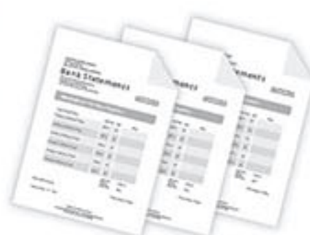
Bank Statements - latest 3 months -