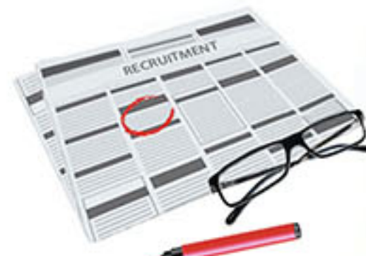
Local Recruitment Exercise - Job Posting & Candidates' CVs-

Employer will need to provide additional documents if the Company didn't receive any Employment Visa Approval in the last 18 months