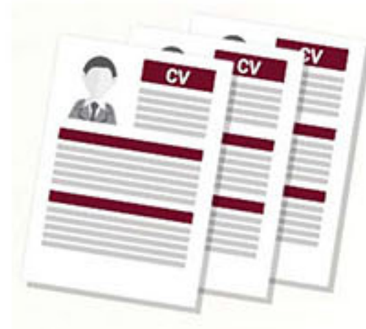
Up to date Resume