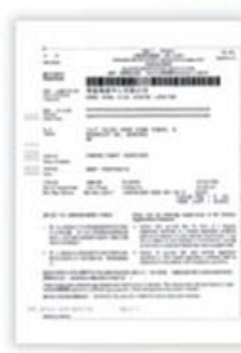
Updated Business Registration Certificate