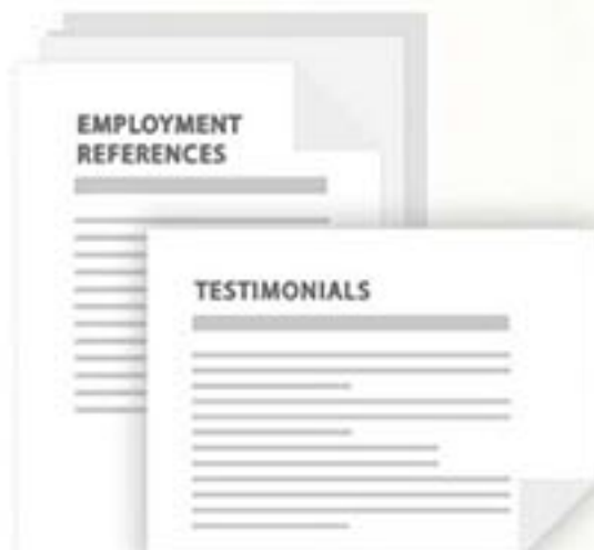
Employment References and Testimonials