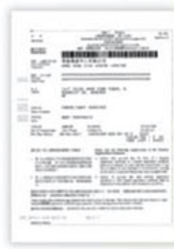
Updated Business Registration Certificate