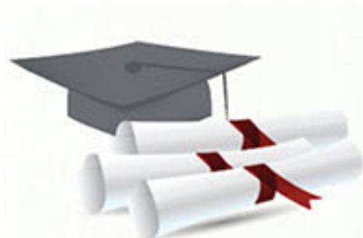
Proof of Academic Records