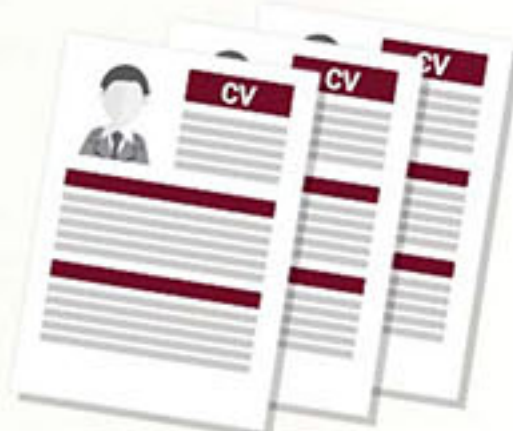
Up to date Resume