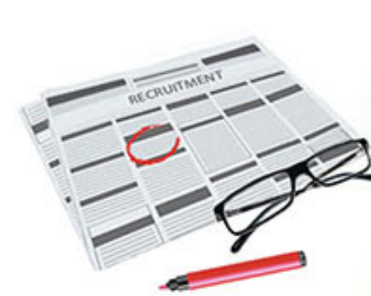
Local Recruitment Exercise - Job Posting & Candidates' CVs-

Employer will need to provide additional documents if the Company didn't receive any Employment Visa Approval in the last 18 months