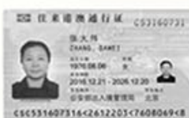
PRC Passport, Exit-Entry Permit & Mainland ID Applicant and each family member