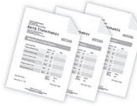
Bank Statements - latest 3 months -