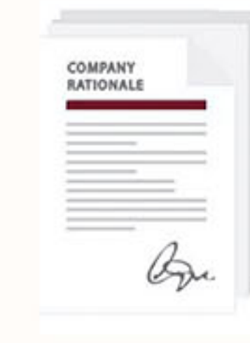
Letter introducing the Company - Business Plan -