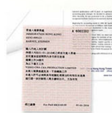
Current Hong Kong Employment Visa