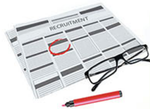
Local Recruitment Exercise - Job Posting & Candidates' CVs-

Employer will need to provide additional documents if the Company didn't receive any Employment Visa Approval in the last 18 months