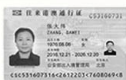
PRC Passport & Exit-Entry Permit