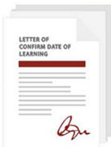
Termination of Employment Letter confirming the Date of Leaving - from previous employer -