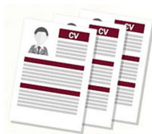
Up to date Resume