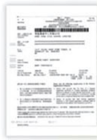
Updated Business Registration Certificate