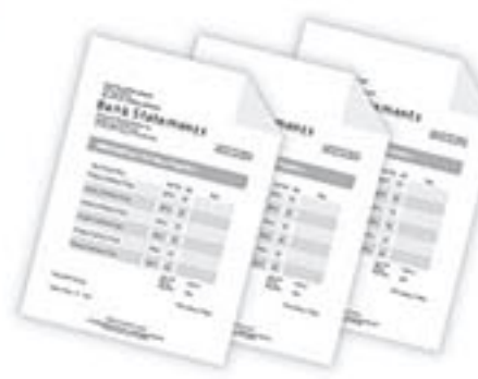
Bank Statements - latest 3 months -