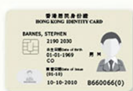
Hong Kong ID