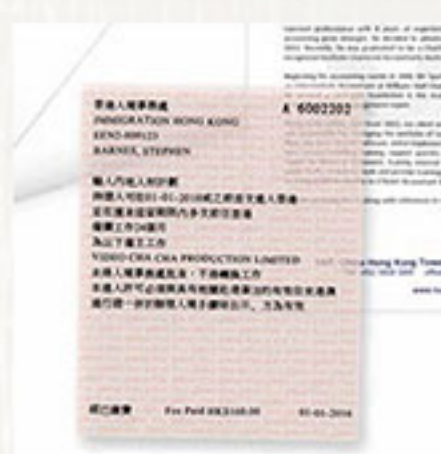
Hong Kong ID and Current Employment Visa