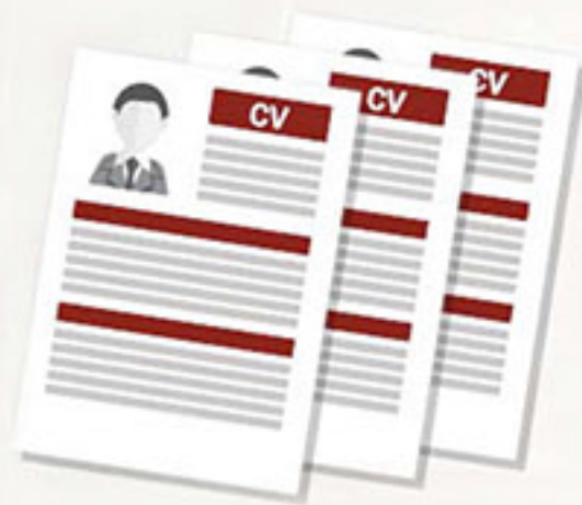
Up to date Resume