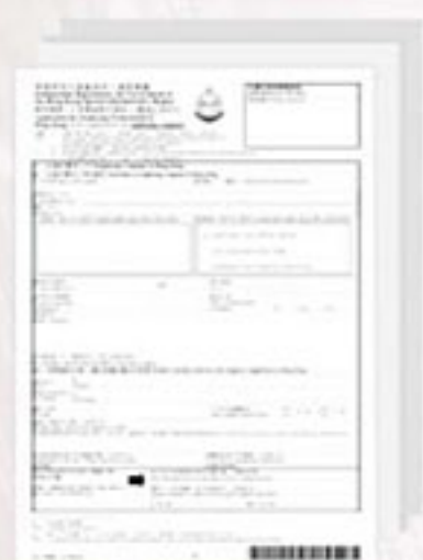
Sponsorship Form ID990B

if the Company obtained an Employment Visa Approval in the past 18 months