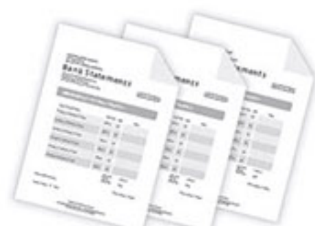
Bank Statements - latest 3 months -