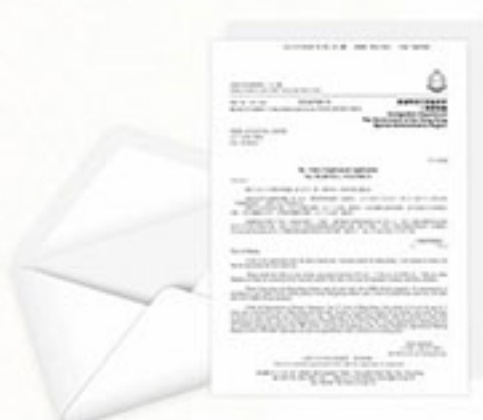
Approval Letter from Immigration Department