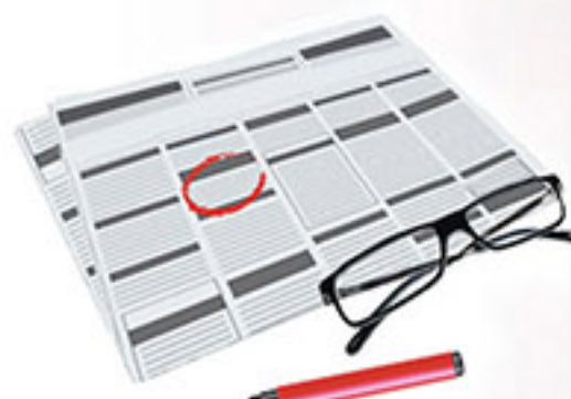
Local Recruitment Exercise - Job Posting & Candidates' CVs-

Employer will need to provide additional documents if the Company didn't receive any Employment Visa Approval in the last 18 months