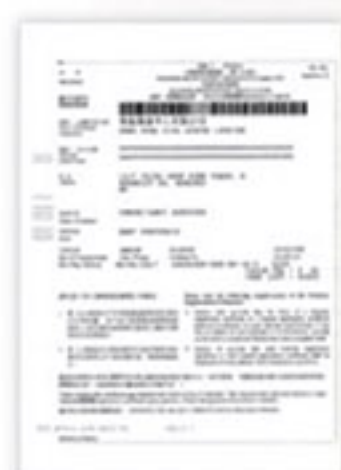
Updated Business Registration Certificate