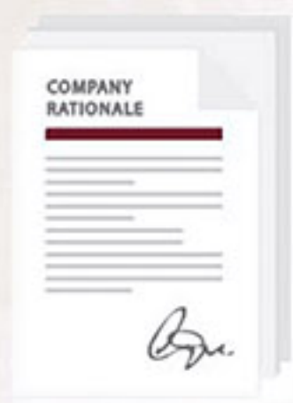
Letter introducing the Company - Business Plan -