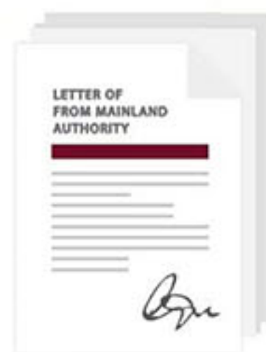
Letter of Consent ID990A page 5 from employer in China or relevant Mainland Authorities