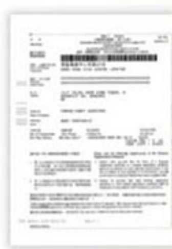
Updated Business Registration Certificate