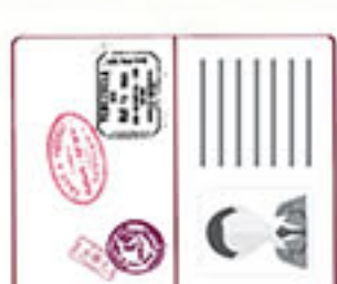
PRC Passport/ Exit-Entry Permit/ Chinese ID