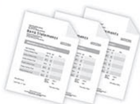
Bank Statements - latest 3 months -