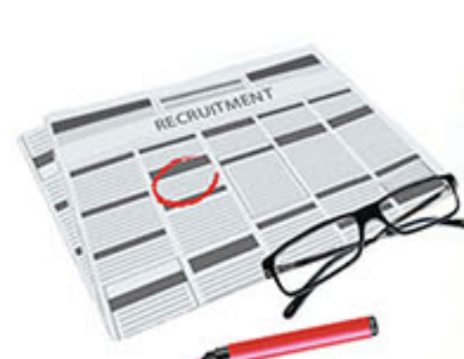
Local Recruitment Exercise - Job Posting & Candidates' CVs-

Employer will need to provide additional documents if the Company didn't receive any Employment Visa Approval in the last 18 months