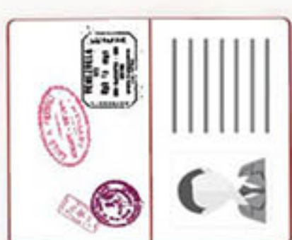
Passport -Applicant & each family member-