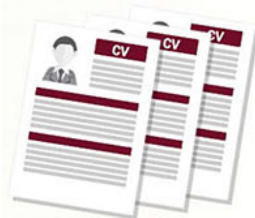
Up to date Resume