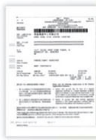
Updated Business Registration Certificate