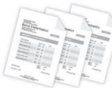
Bank Statements - latest 3 months -