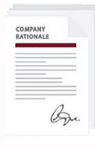
Letter introducing the Company - Business Plan -