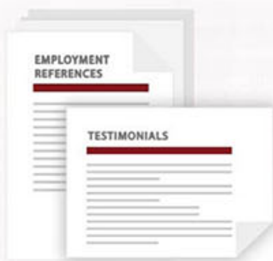
References from previous employer