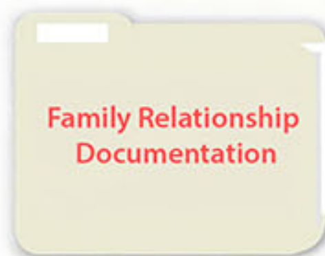
Proof of Family Relationship - Marriage Certificate, Birth Certificate -