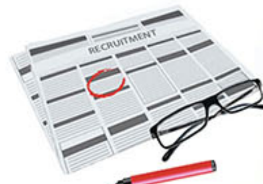
Local Recruitment Exercise - Job Posting & Candidates' CVs-

Employer will need to provide additional documents if the Company didn't receive any Employment Visa Approval in the last 18 months