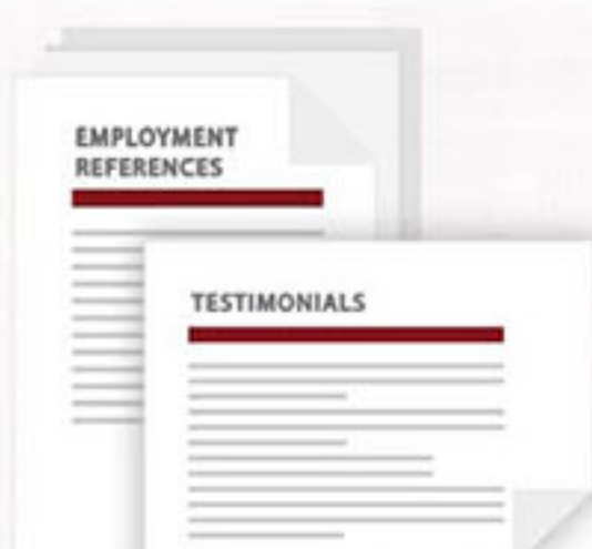
Previous Employment References