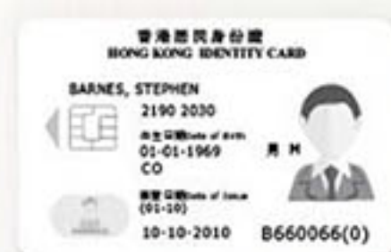
Hong Kong ID and Current Valid Dependant Visa