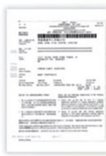
Updated Business Registration Certificate