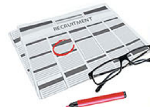
Local Recruitment Exercise - Job Posting & Candidates' CVs-

Employer will need to provide additional documents if the Company didn't receive any Employment Visa Approval in the last 18 months