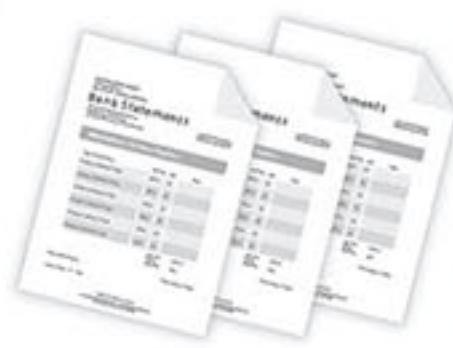
Bank Statements - latest 3 months -