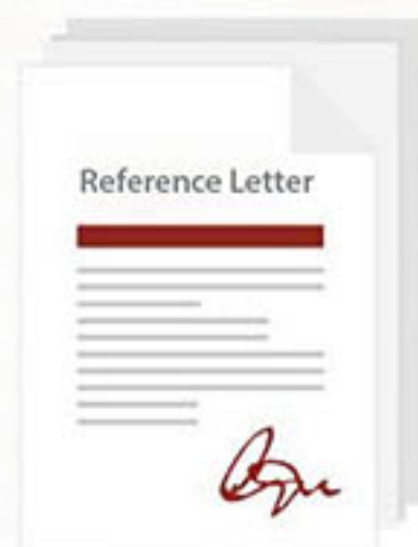
Employment References and Letter of Consent ID990A page 5 from employer in China or relevant Mainland Authorities