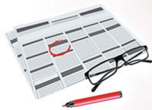
Local Recruitment Exercise - Job Posting & Candidates' CVs-

Employer will need to provide additional documents if the Company didn't receive any Employment Visa Approval in the last 18 months