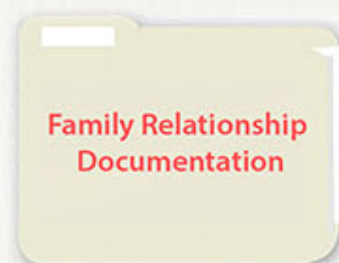
Proof of Family Relationship - Marriage Certificate, Birth Certificate -