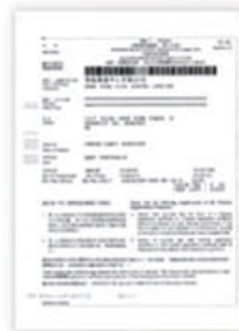
Updated Business Registration Certificate