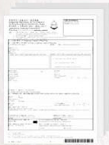
Sponsorship Form ID990B

if the Company obtained an Employment Visa Approval in the past 18 months