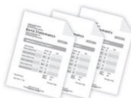
Bank Statements - latest 3 months -