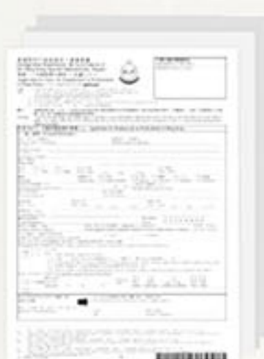
Application Form ID990A