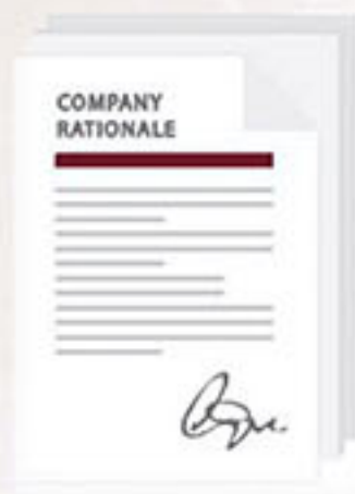
Letter introducing the Company - Business Plan -