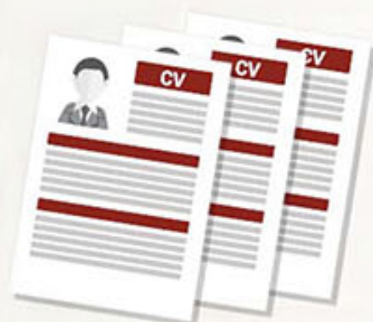
Up to date Resume