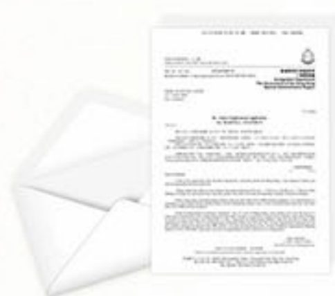
Approval Letter from Immigration Department