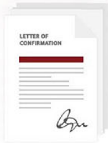
Termination of Employment Letter confirming the Date of Leaving - from previous employer -