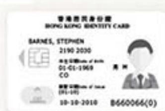
Hong Kong ID and Current Employment Visa