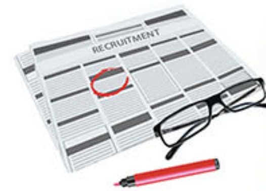
Local Recruitment Exercise - Job Posting & Candidates' CVs-

Employer will need to provide additional documents if the Company didn't receive any Employment Visa Approval in the last 18 months