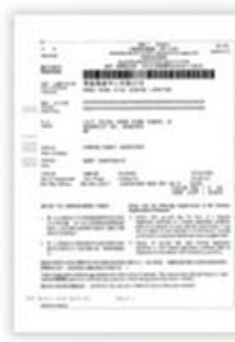
Updated Business Registration Certificate