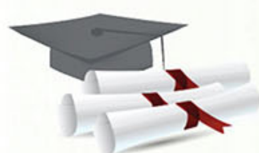
Proof of Academic Qualifications