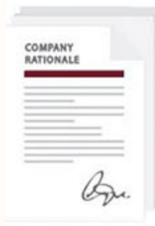
Letter introducing the Company - Business Plan -