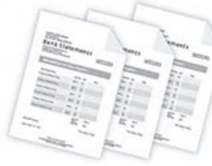
Bank Statements - latest 3 months -