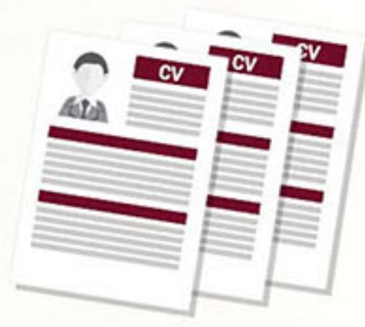
Up to date Resume