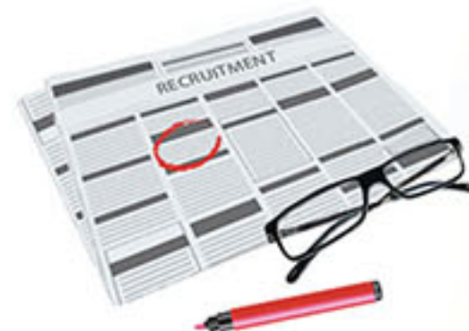
Local Recruitment Exercise - Job Posting & Candidates' CVs-

Employer will need to provide additional documents if the Company didn't receive any Employment Visa Approval in the last 18 months