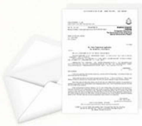
Approval Letter from Immigration Department