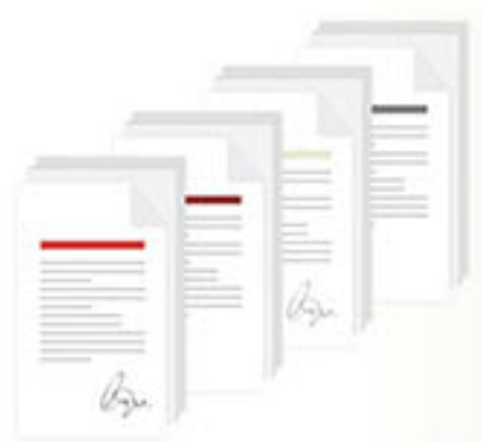
Employment References and Testimonials