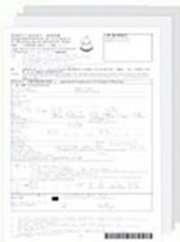
Sponsorship Form ID990B

if the Company obtained an Employment Visa Approval in the past 18 months