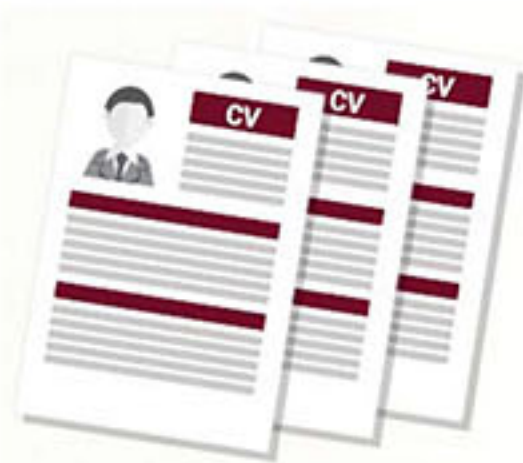
Up to date Resume