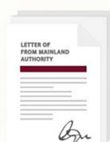
Letter of Consent ID990A page 5 from employer in China or relevant Mainland Authorities