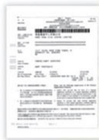
Updated Business Registration Certificate