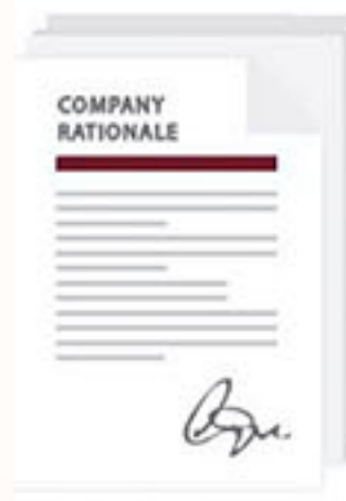
Letter introducing the Company - Business Plan -