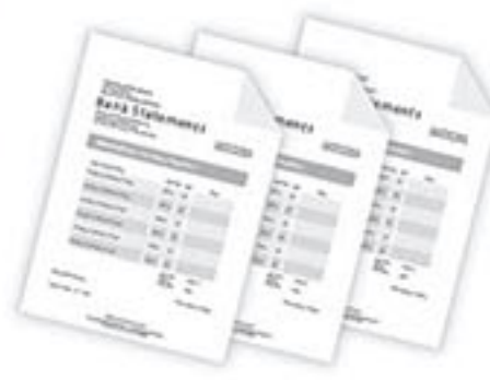
Bank Statements - latest 3 months -