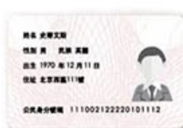
PRC Passport & Exit-Entry Permit/ Chinese ID