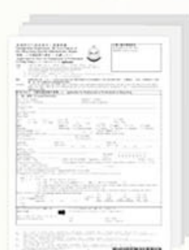
Application Form ID990A